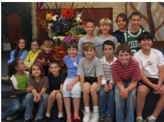
Kitah Aleph & Bet Hebrew classes.