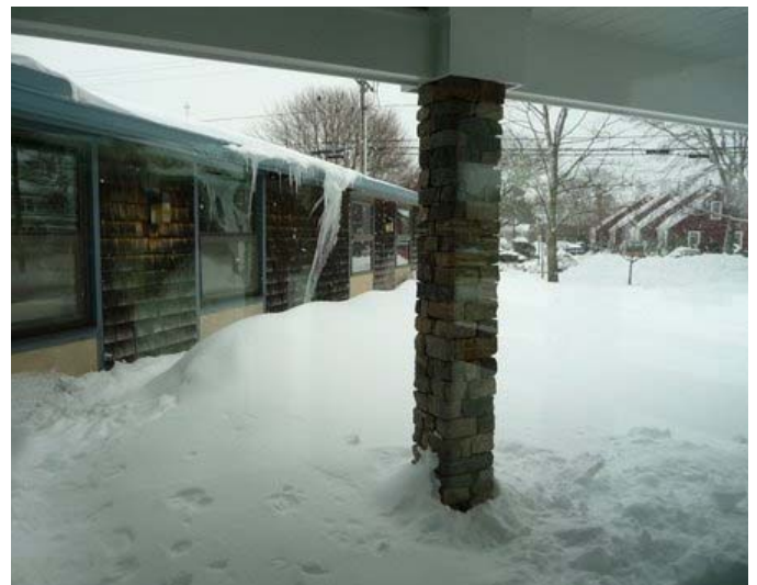
The December snow storm forced the cancellation of all Synagogue activities on December 22.