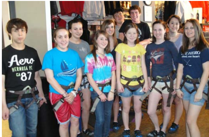
CAPT kids at a recent rock climbing field trip.

CAPT welcomes all 8 - 12 graders. For information contact Martha Chaprut, 508 775 2988 or chaprut@verizon.net